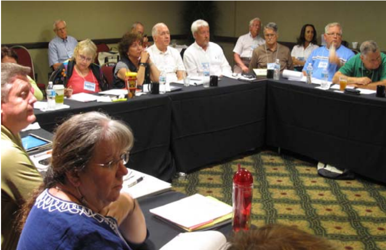
The one and a half day State Chairs meeting was well attended by all of the State Chairs or a designated representative.