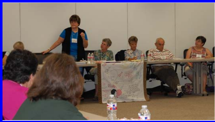
All three Subcommittee meetings were well attended and productive. Above: Kairos Torch, Kairos Inside, and Kairos Outside Subcommittees.